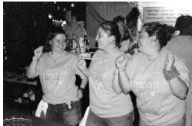
Zeta Lambda members serving up drinks and entertainment at Barefoot on the Beach.

boogied down on the dance floor and where even seen doing the limbo. Zeta Lambda has mad skills at limbo by the way! Needless to say the weekend was a blast and we were able to support a truly wonderful cause in the process!