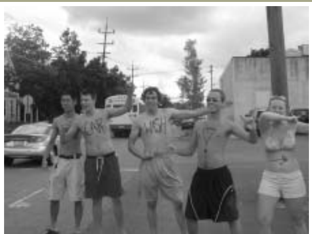
Zeta Delta members flag down cars to raise money for hurricane relief.

We are planning on helping out at the TOP Soccer Fall Classic in October. We are also going to